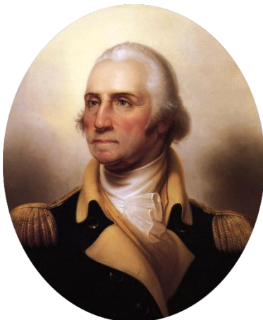
February 22 - George Washington

Did you know that Abraham Lincoln and George Washington were born in February. Can you guess which days?