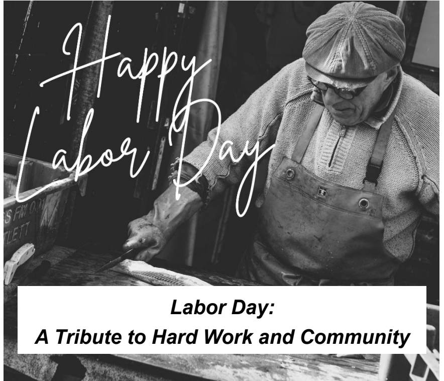
Labor Day: A Tribute to Hard Work and Community

Here in our community, Labor Day is a time to celebrate not only the workers of the past who shaped our nation, but also the dedication we see every day—from staff who keep things running smoothly to residents who share their time, skills, and energy.