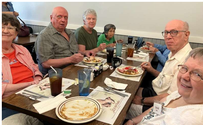
Diener's Country Restaurant and shopping