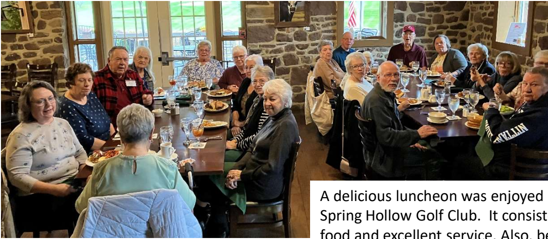
A delicious luncheon was enjoyed by 21 SRC friends at Spring Hollow Golf Club. It consisted of great friends, food and excellent service. Also, beautiful surroundings!